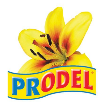
PRODEL<sup>®</sup> Professional Odour Eliminator for Extreme Odours

ODELZYME <sup>®</sup> contains three selected adaptive strains and seven sub-strains of bacillus bacteria. The bacteria count in the ready-to-use product is 100 billion per 3.8 litres! The product contains enzymes and bacteria. The enzymes help cut the organic matter into smaller, more digestible particles that are eaten by the bacteria. The bacteria we use are non-pathogenic and non-toxic which means they are safe and harmless to everything but organic odours.